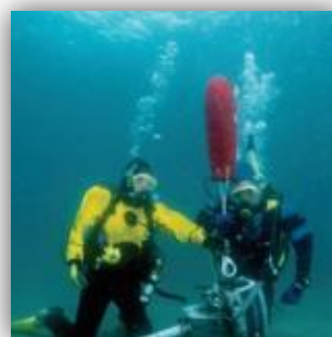
Search and Recovery