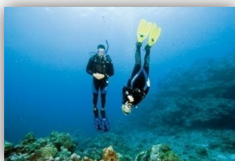
Peak Performance Buoyancy